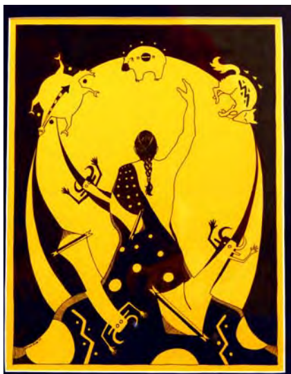
Star Horn Painting, drawing, jewelry